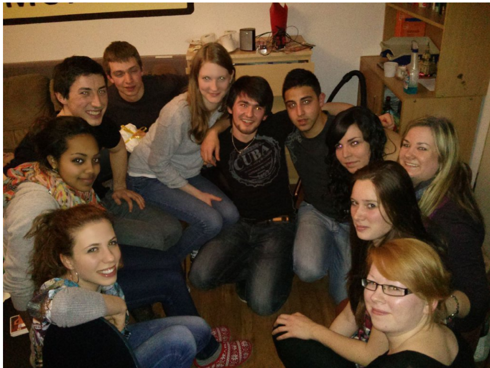
My birthday's photo.

different principles and interests but still young energetic (and not so) students which are hungry to life, to adventures and new impressions.