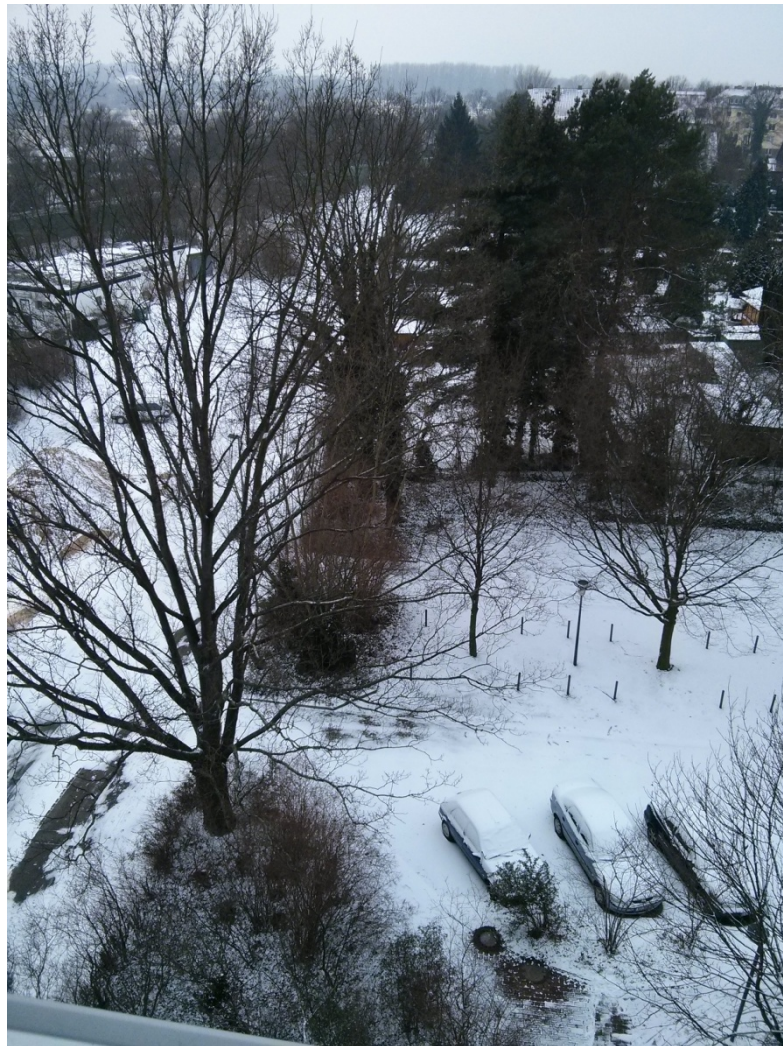
Some unique days with snow.

Winter is warmer than in Russia. When people say that it's cold and was surprised by snow – only on that moment I felt like the real winter came. However it lasted less than one week. From some points of view I would say that I missed Russian winter with snow and cold temperature, cold and ice, because for me winter should be winter but not the never ending November.